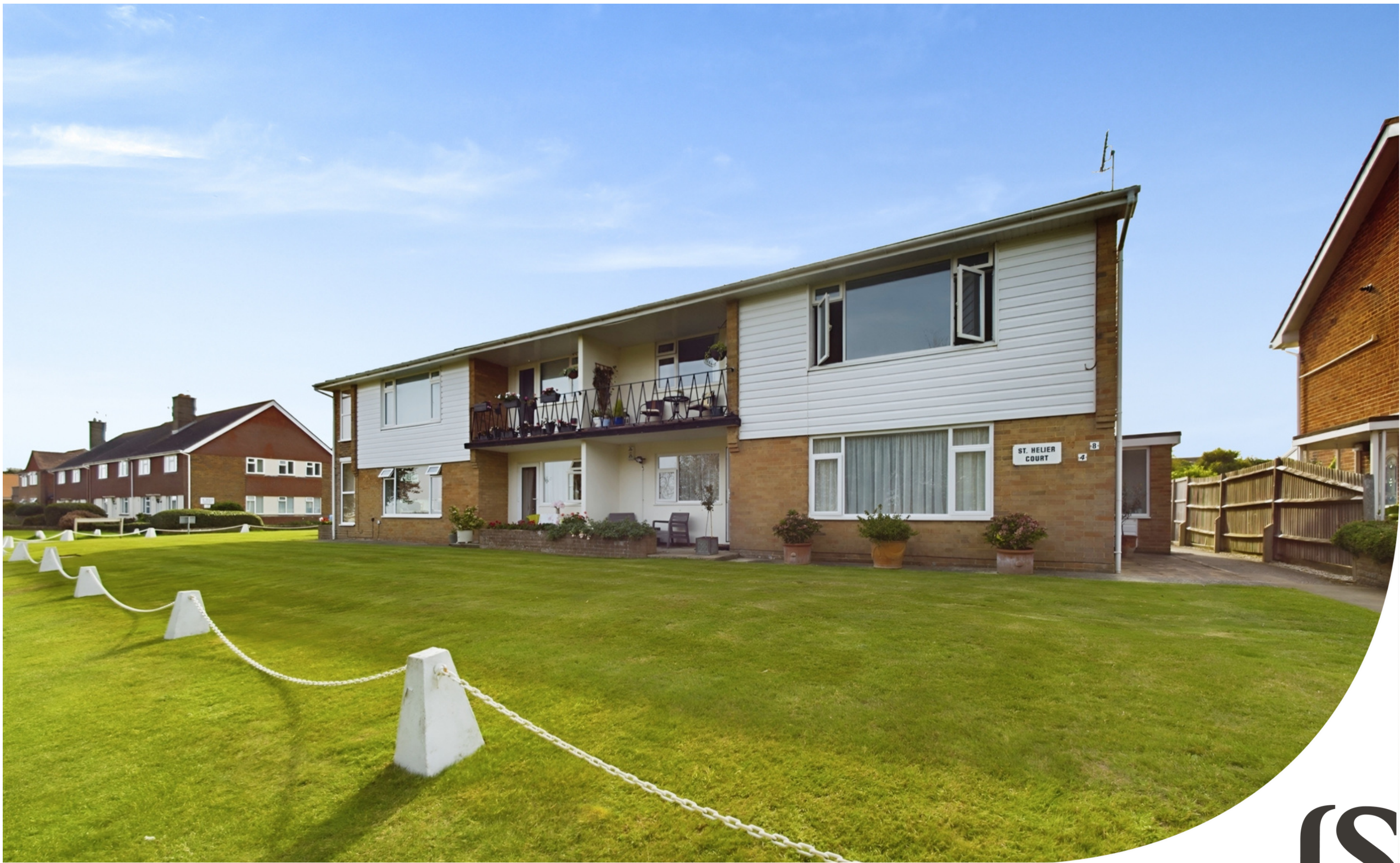
St Helier Court | St Heiler Road | Ferring | BN12 5EX Asking Price Of £325,000